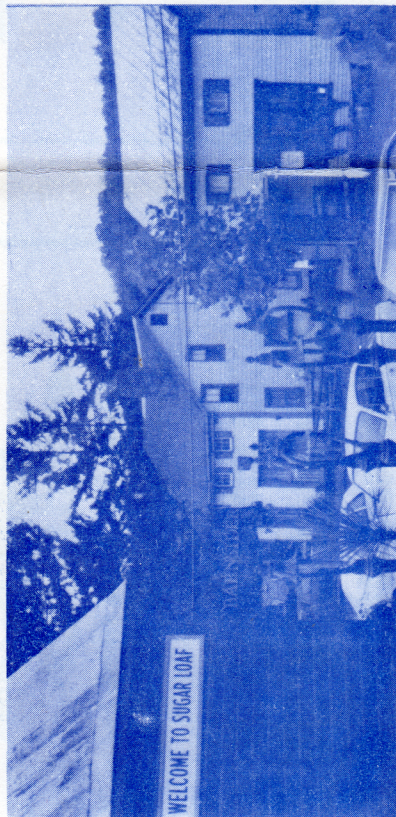
Sugar Loaf Mountain

In the late 1700's the stage coach started through Sugar Loaf on its run from New Jersey to New Windsor where it connected with the packet for New York.